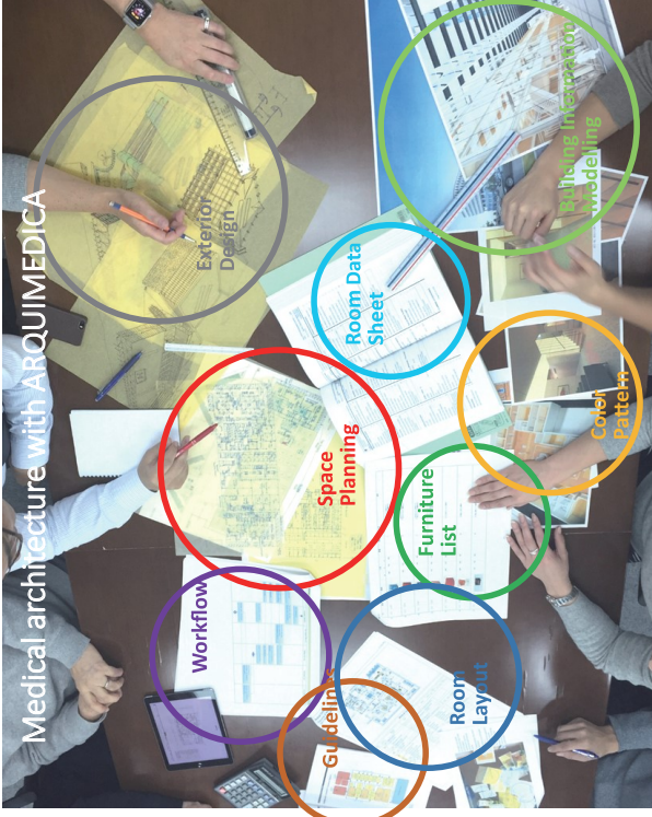
Medical architecture with ARQUIMEDICA

Our goal is to create better solutions and to realize best environments that meet high need of stakeholders. Better programs and better managements for projects bring us best results. We are always thinking "Better approach method". To achieve our idea we take the comprehensive approach based on requirement analysis, field survey browsing guidelines and communicate with stakeholders.