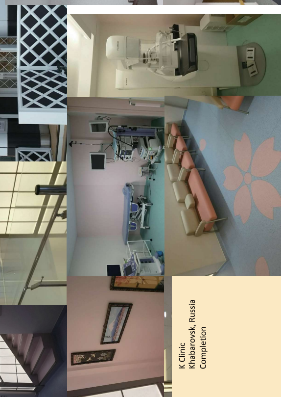
K Clinic Khabarovsk, Russia Completion